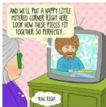
Quilting with Bob Ross.